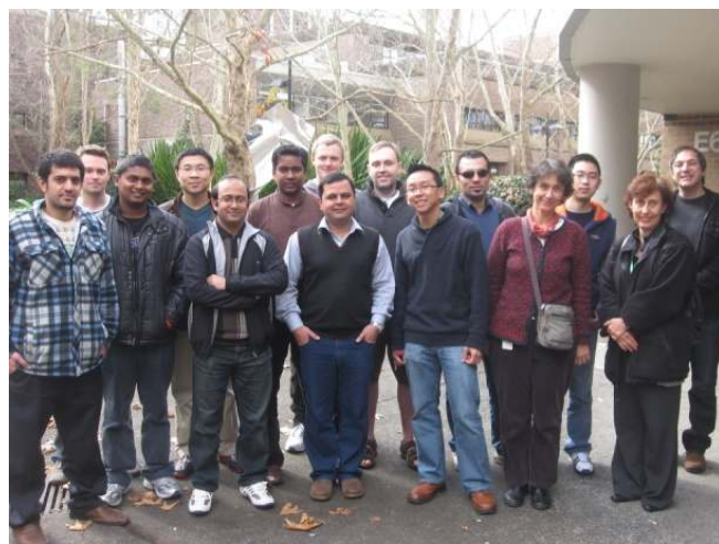
2010 MQEC Committee Executives and Volunteers