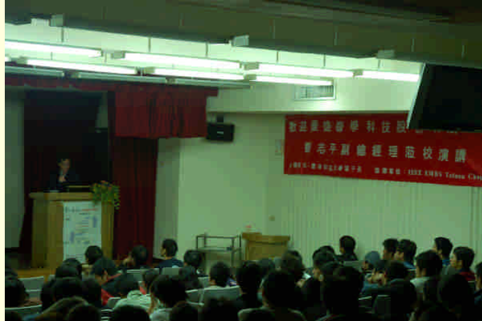
China's Medical Equipment Industry – An Overview