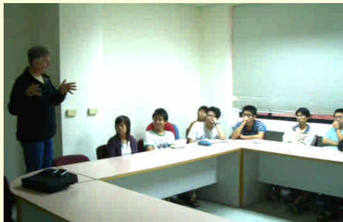
Recent Developments in the Design of Biopotential Amplifiers