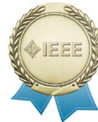
Outstanding Section Membership Recruitment and Retention Performance

Four more Sections join the list this month, highlighted below.