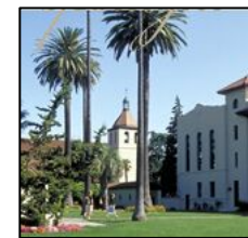
Santa Clara University