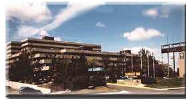
Coast Terrace Inn