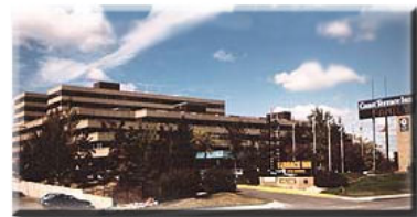
Coast Terrace Inn