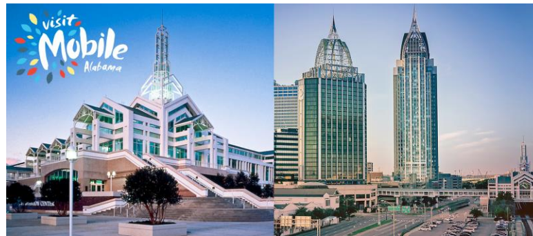
Arthur R. Outlaw Mobile Convention Center

One South Water Street Mobile, Alabama 36602