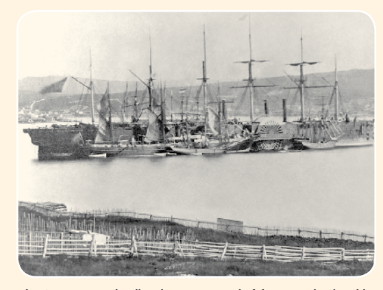
The Great Eastern landing the western end of the transatlantic cable. IEEE Newfoundland-Labrador Section

• First 735 KV AC Transmission System, 1965