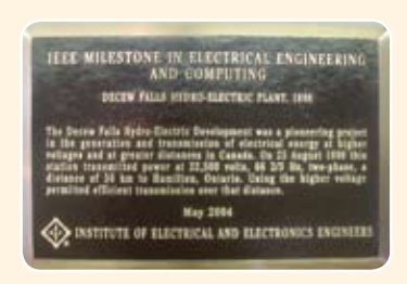
For every Milestone, a bronze plaque commemorating the achievement is placed at an appropriate site.

The Brantford-to-Paris call, which included a one-way conversation to Bell from his relatives and the voices of a choir singing in Brantford, took place over the telegraph network. The Paris site where the plaque is displayed was the local telegraph office at the time. The building has been rebuilt a number of times due to fires, most recently in 1901, and used for other purposes, but the site has always been remembered for its contribution to communications history, Maryan says.