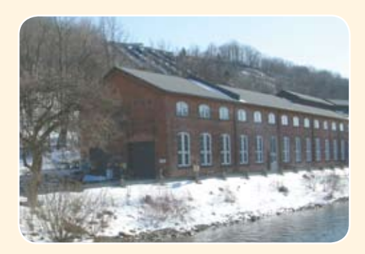
Decew Falls original building. IEEE Hamilton Section

The story of one of IEEE's newest milestone—the first long-distance voice transmission—was recently published in The Institute (7 May 2008).