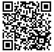
QR Code to get eVersion of TechVeda