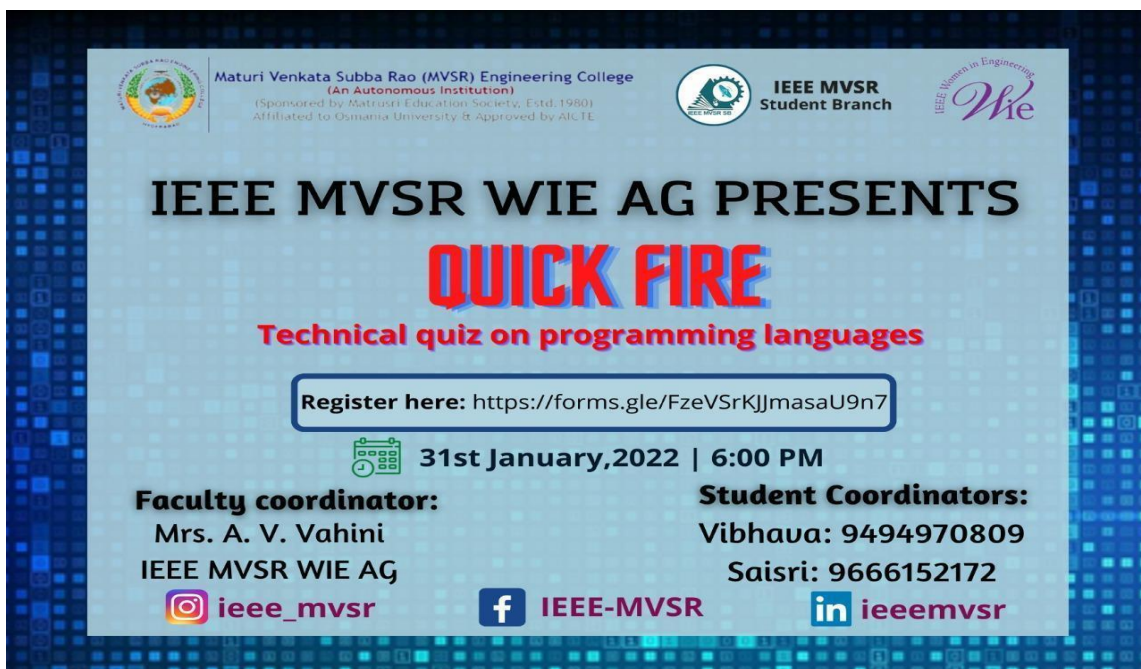
Poster of the event