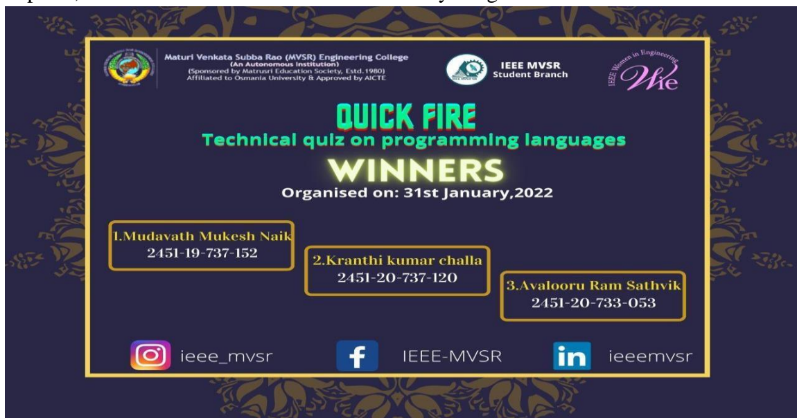
Winners of the quiz

There were 34 qualifiers for the final round. Round 2 was conducted on the same platform. All the student organizers were available to the participants during the quiz for any help. Round 2 was completed successfully. After the analysis of the scores and based on the performance of the participants, the winners were announced and heartily congratulated.