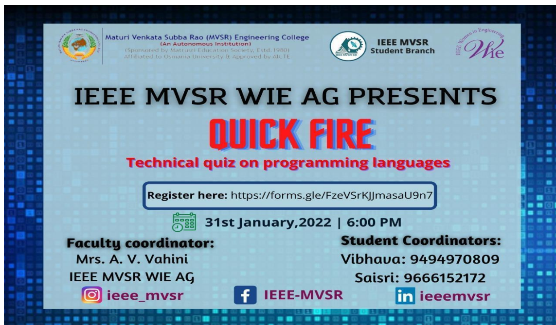
Poster of the event