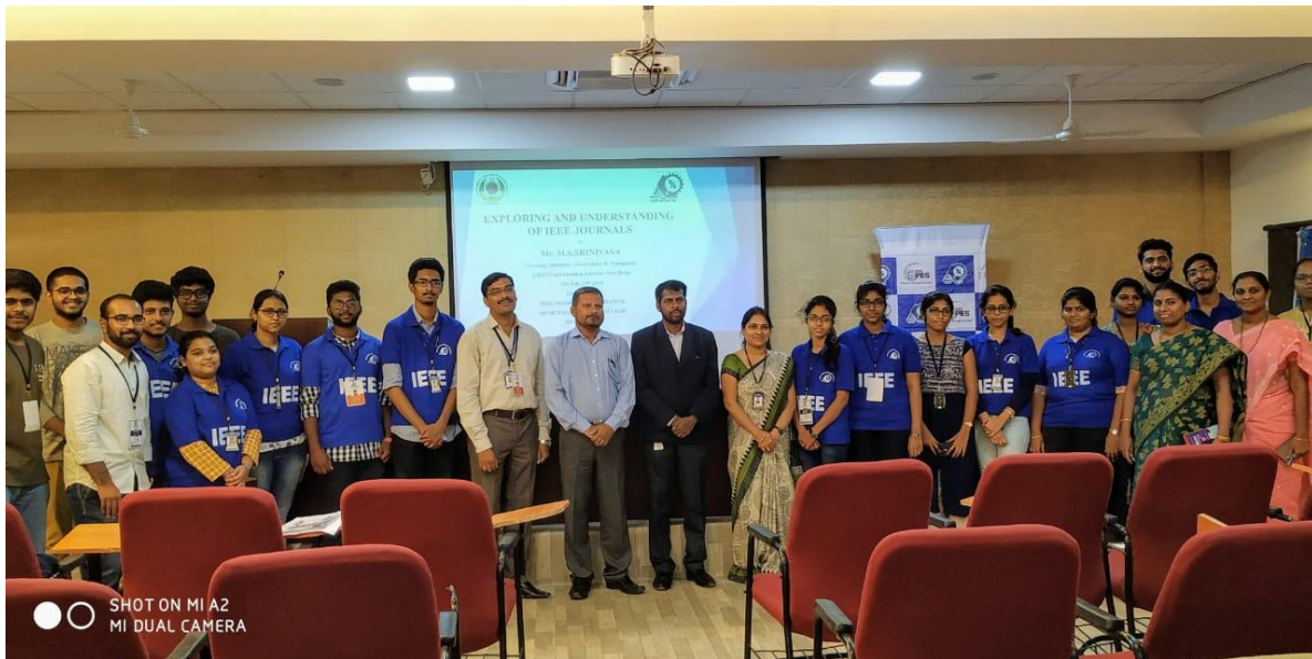
Speaker with the IEEE student volunteers and faculty.