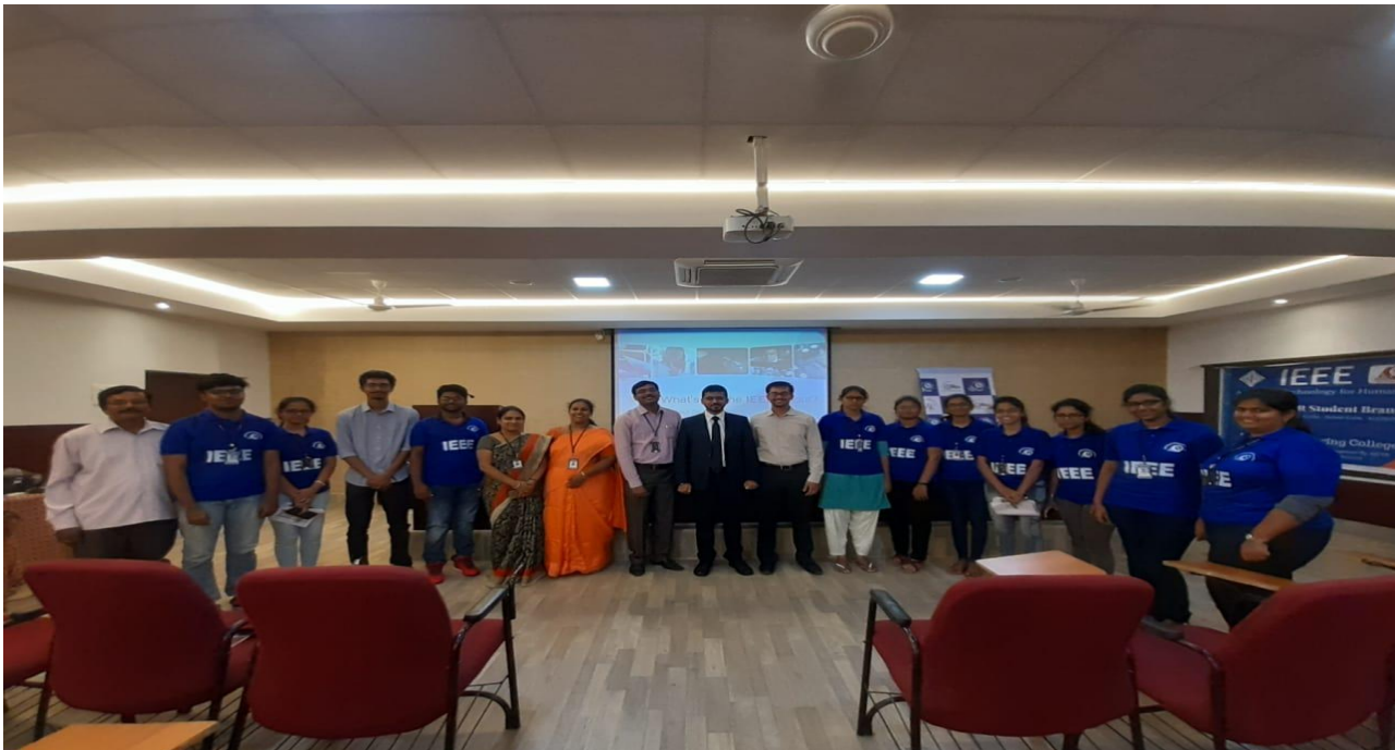
Speakers with the IEEE student volunteers and faculty.