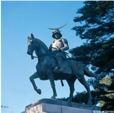
伊達 政宗 (1567 -1636)

Department of Electronic Engineering, Graduate School of Engineering, Tohoku University