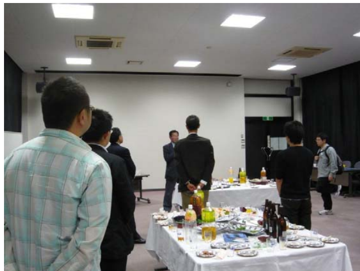
2010 IEEE Student Branch Leadership Training Workshop