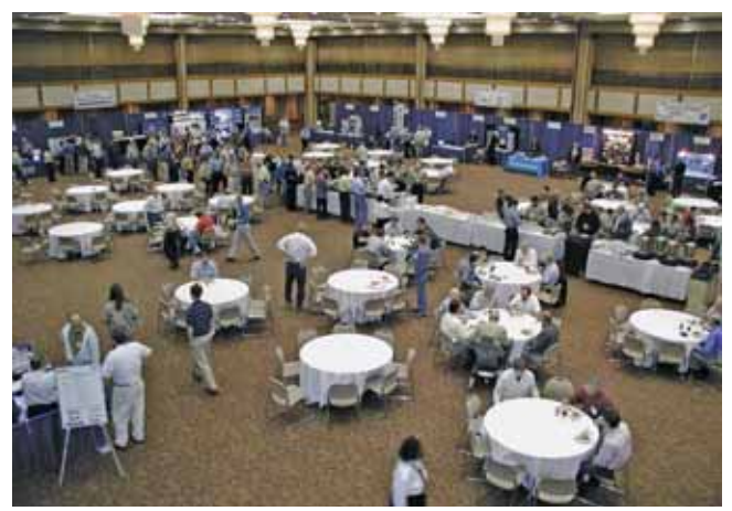
The exhibit area during the Huntsville one day EMC event was packed with 42 exhibitors, 190 engineers, over 40 door prizes and all the food you could eat!

were very positive, everything from "like drinking from a fire hose" to "First class. Dr. Archambeault was perfect -- PhD education with a practical, down-to-earth approach." Vendor response was very positive as well, with an excellent rating on the exhibit hall venue. We are already thinking ahead to our next event in 2010. We hope to see you all there!