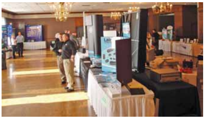
The 24 Chicago MiniSymposium exhibitors occupied a large area adjacent to the technical presentation room.