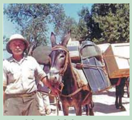
One of the Greek helpers getting ready to hit the trail. Look at the size of those wooden crates!