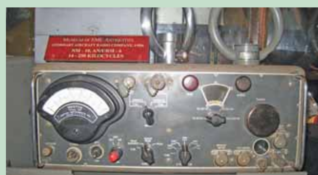
One of the instruments used in the Greek Island Survey: The Stoddart NM-10, a 14 kHz to 250 kHz receiver.