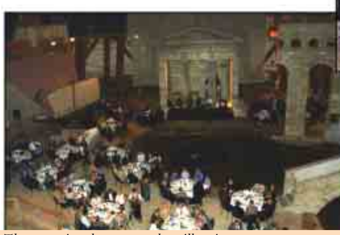
The symposium banquet at the millennium tower, a museum of human history and science.