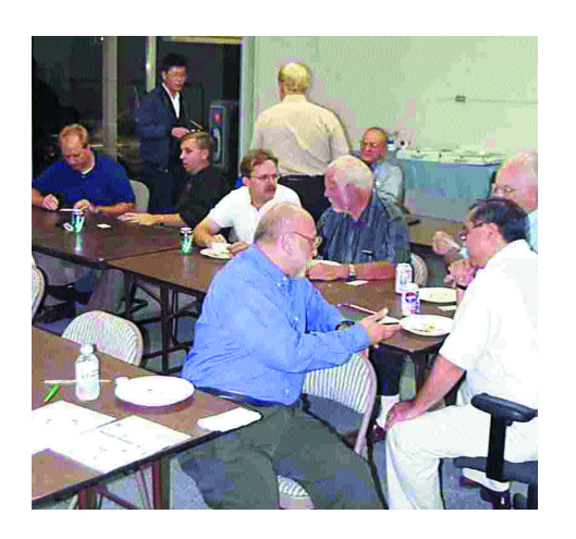
A crowd gathered at the October meeting of the Orange County EMC chapter held at CKC Laboratories in Brea, California.