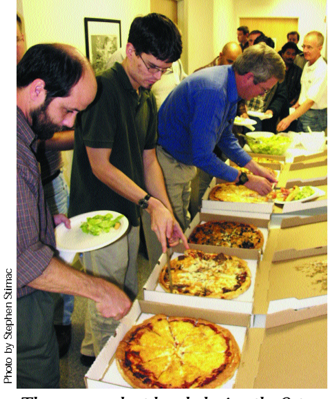
There was a short break during the October workshop sponsored by the Seattle EMC Chapter with plenty of pizza for all.