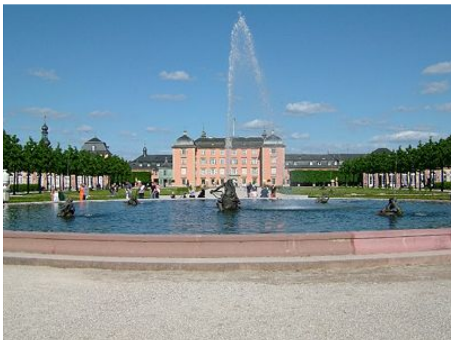
Banquet at the Schwetzingen Palace on June 18, 2007.

The conference site, the Congress Center Karlsruhe, is located near the Baroque Palace in the center of Karlsruhe, Germany. Karlsruhe is a hospitable city, in the State of Baden-Württemberg, beautifully located in the upper Rhine valley between the wooded mountains of the Black Forest, the vineyards of the Palatinate (Pfalz), and the Vosges in France with a mild climate. Heinrich Hertz conceived and performed his brilliant fundamental experiments confirming Maxwell's theory at the University of Karlsruhe (1886-1888). The University of Karlsruhe has close scientific and academic relations to the Research Center Karlsruhe (Forschungszentrum Karlsruhe) with the aim of founding the Karlsruhe Institute of Technology (KIT).