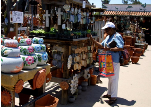
Batali's Pizzeria Mozza.

Seaport Village, a 14-acre bayfront shopping and dining complex, recreates a California harbor setting of a century ago. Amid cobblestone pathways, ponds, fountains and lush landscaping, Seaport Village offers themed shops, restaurants and cafes.