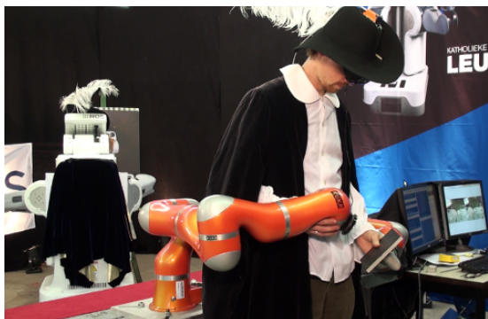
Fig. 1. Illustration of the original setup. In the front the human operator is operating the two KUKA-LWR arms, is wearing VR goggles (displaying the images of the eye cameras of the PR2), and IMU sensor on the head (to couple his head motion to the one of the PR2). In the back the PR2 is used as a slave to perform an “artistic” painting task using the haptic coupling between the KUKA-LWR arms and the PR2.

at http://www.ros.org/wiki/orocos_toolchain_ros . We give a live overview of the available features: