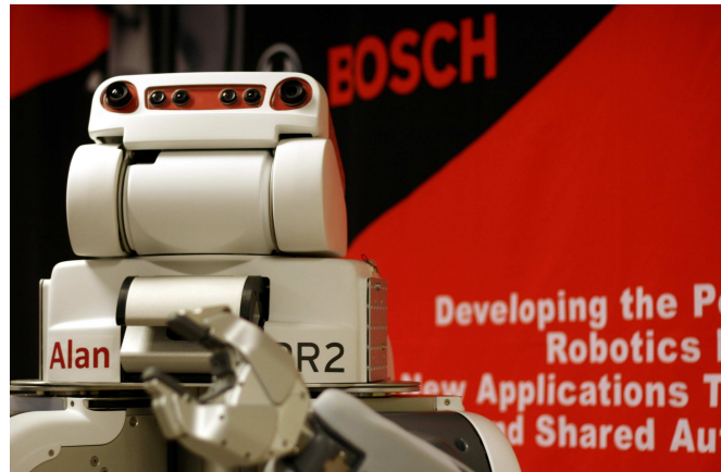
Fig. 1. Alan, the PR2 robot at Bosch Research and Technology Center.

PR2 is an ideal platform for this project because the high precision arms enable precise error characterization of the state estimation techniques.